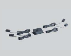
Infrared Passenger Sensor