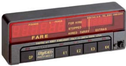
ET807E · 1986