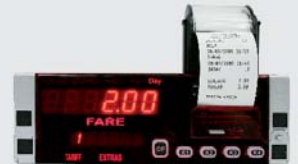
F3 · 2000