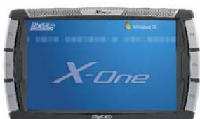
X-One · 2009