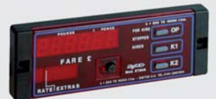
ET806 · 1985