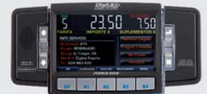
FORCE ONE · 2008