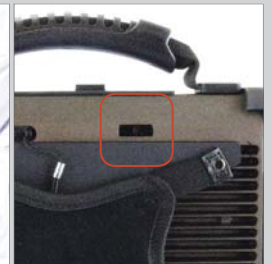
Color Camera High Definition 1.3 Megapixel Embedded