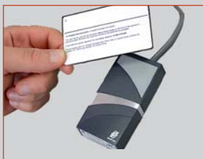
Contactless Card Reader