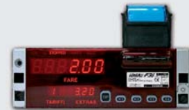
F3 PLUS · 2002