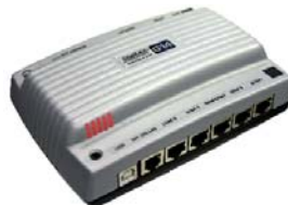
G14 · 2005