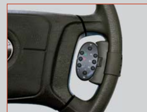
Steering wheel remote control