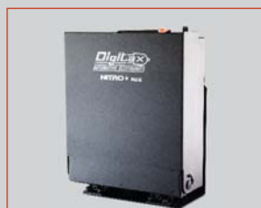
Nitro+ Docking Station