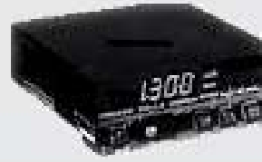
ET807 · 1984