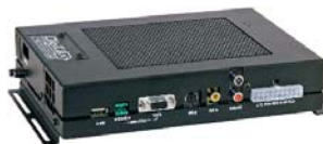
4GMCU · 2008