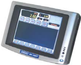
MDT · 2002