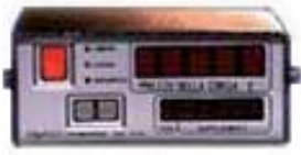
LT805 · 1981