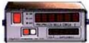
LT805S · 1982