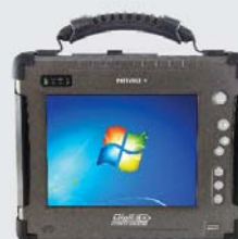
NITRO+ · 2010