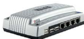
G14CE · 2010