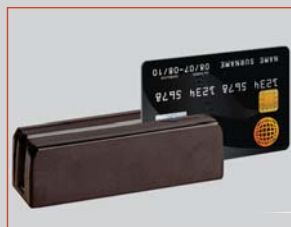
Magnetic Card Reader