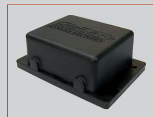
Battery Pack for 3GMDT