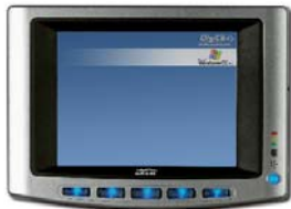
3GMDT · 2004