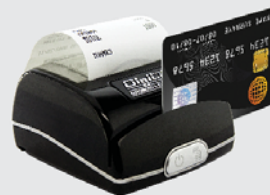
Printer TRE · 2008