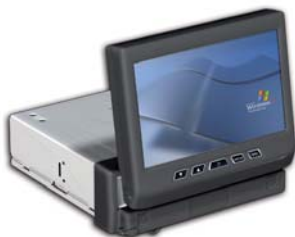
InDash MCU · 2007