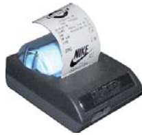
Printer 2 · 1996