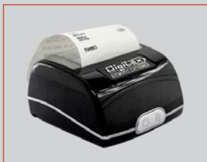
Printer TRE Basic