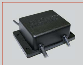
K-Line Sniffer Box