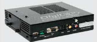
3GMCU · 2007