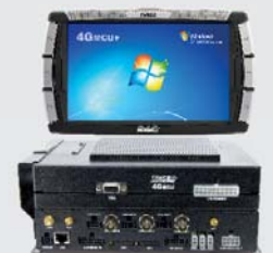
4GMCU+ · 2010