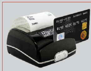
Printer TRE Full