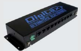
G14 · 2003